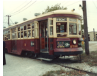
vintage streetcar, Toronto, Canada